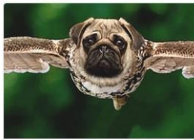
The Lazy Dog