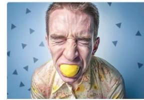
Conversation Controlling Lemon