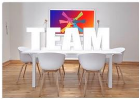
There is No 'T' in Team

All Corporate gifts Gifts Lifestyle Pets